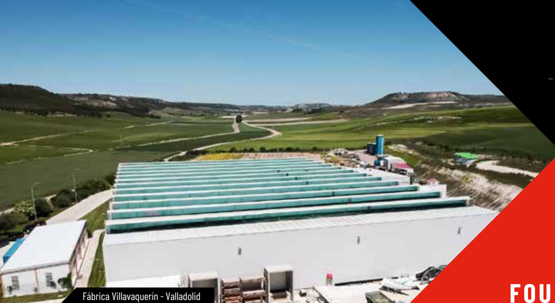
Fábrica Villavaquerín - Valladolid